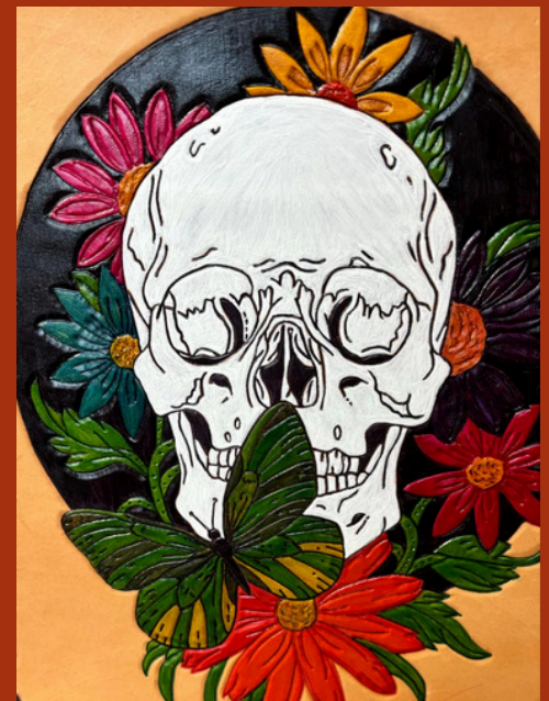
Skeleton design with Floral pattern background as a book cover.