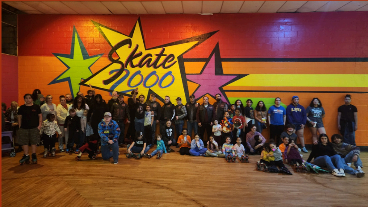
Youth Skating Party @ Skate 2000 in Bridgeton, NJ, completely sponsored by Redrum MC Lenape Chapter, including youth from both Nanticoke and Lenape communities of all ages.