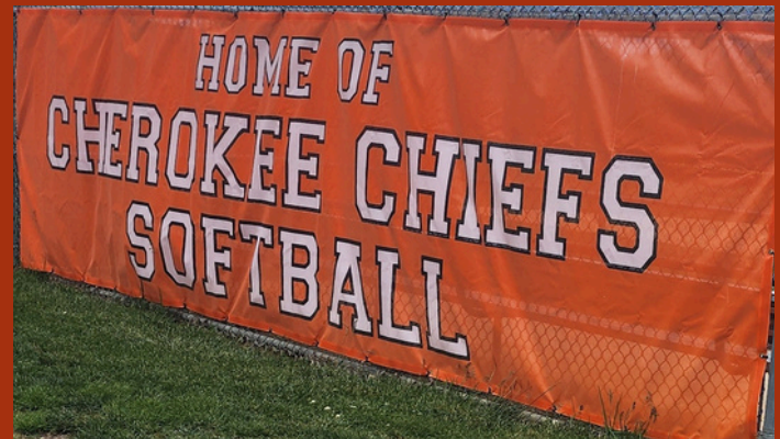
Lenape School District (not associated with any Lenape communities), Cherokee Chiefs, Marlton, NJ