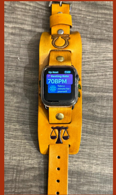
Mixing modern technology with Indigenous Art

“...I am self taught and slowly as time went by I continued on in my ventures making belts, purses, key chains and anything I could make magic on leather. I have now been working leather for 37 years and now have my business called Tribal Lethers. This is me and my passion which relaxes me and gives me peace. I love to create these works of art and am proud to be part of the Nanticoke Lenni Lenape Tribe of New Jersey!”