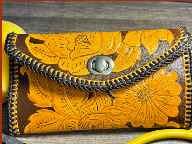
Floral pattern on a small purse