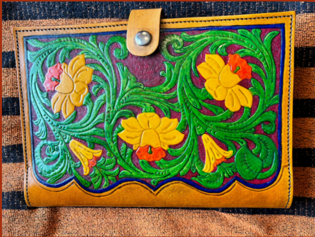
Small Leather Work Purse featuring floral work; a commonly used pattern for Eastern Woodland people, such as Lenape and Nanticoke.