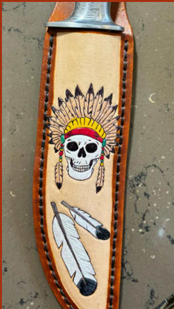
Leather knife sheath.